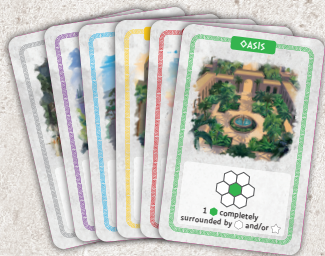
18 Construction cards