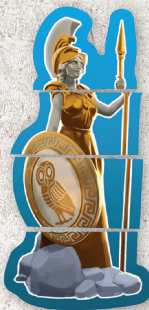
4 Statues of Athena, each in 4 sections