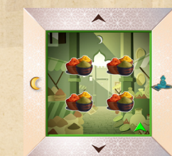
This Market has 4 spices.